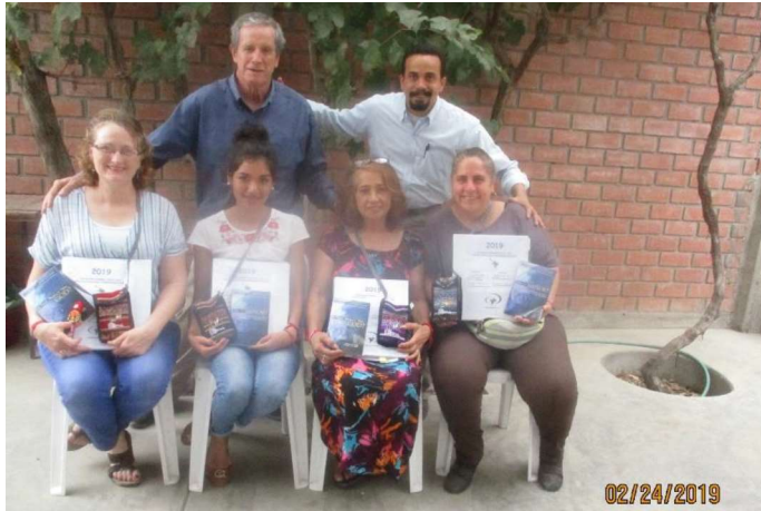
YWAM Ica DTS class gets underway

February zoomed by with this coming up on us. Although we continued to maintain weekly discipleship meetings in our many villages. Links are provided in the box to different photo albums, to show you that we maintain a pretty busy schedule down here and will continue to do so through the class.