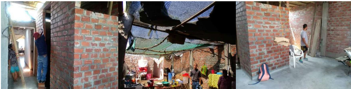
2019 Exterior walls of new bathroom, shower, sink, toilet. Roof water tank

February was a very busy month. We had initiated the “Nelly’s Kitchen” construction project for a very kind widow that has been associated with the mission for a good while. Since we last wrote, we added 3 walls, columns to support walls and ceiling, new ceiling, poured floor (was dirt prior), private walls for bathroom, electrical wiring, plumbing, electrical fixtures and a 1100-liter water tank for the roof which will (when hooked up) give her 24 hours of running water, she only had 1 hour of water a day. There is a good deal of tile work going on now in the new bathroom, which she did not have, as well as a kitchen counter being done. Then, toilet, bath sink and kitchen sink will be installed. Here’s a few quick snapshots before and after. We are aiming to do one of these projects per year with financial support. This particular project ran about $3,500US. So your donations are going to a good cause. Please help us to start funding a similar project for next year. We can give you a full accounting of all funds spent on material and labor.