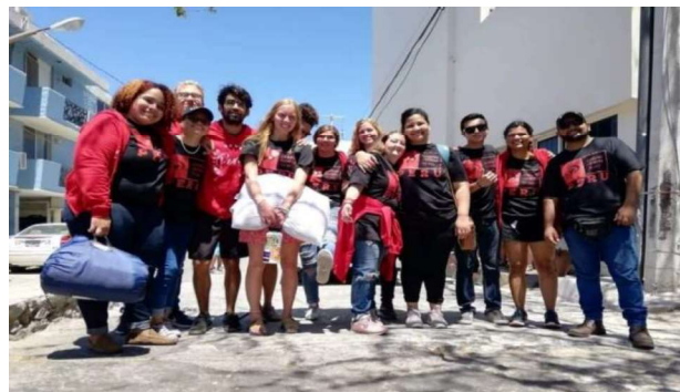
13 of our 14 Mazatlán visitors coming in 10 days.

Our purpose here is to serve the locals. We are dealing with many short term problems (staffing, transportation, resources), but we are looking at the long term. Our bigger problems are the people and how stubbornly they accept that religion is all they need. Most have never owned a bible, they don't know how many gospels there are, nor what is the gospel message. It is doubly sad since they have icons and statues all over the place, cab drivers superstitiously kiss a plastic bobble they have on their dashboard every time they